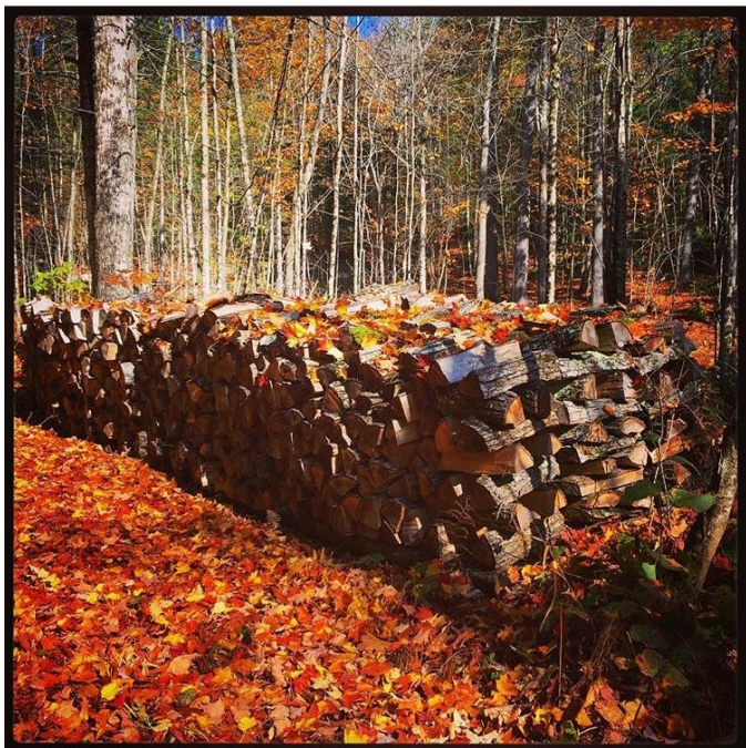
Firewood may contain invasive pests that can kill trees.