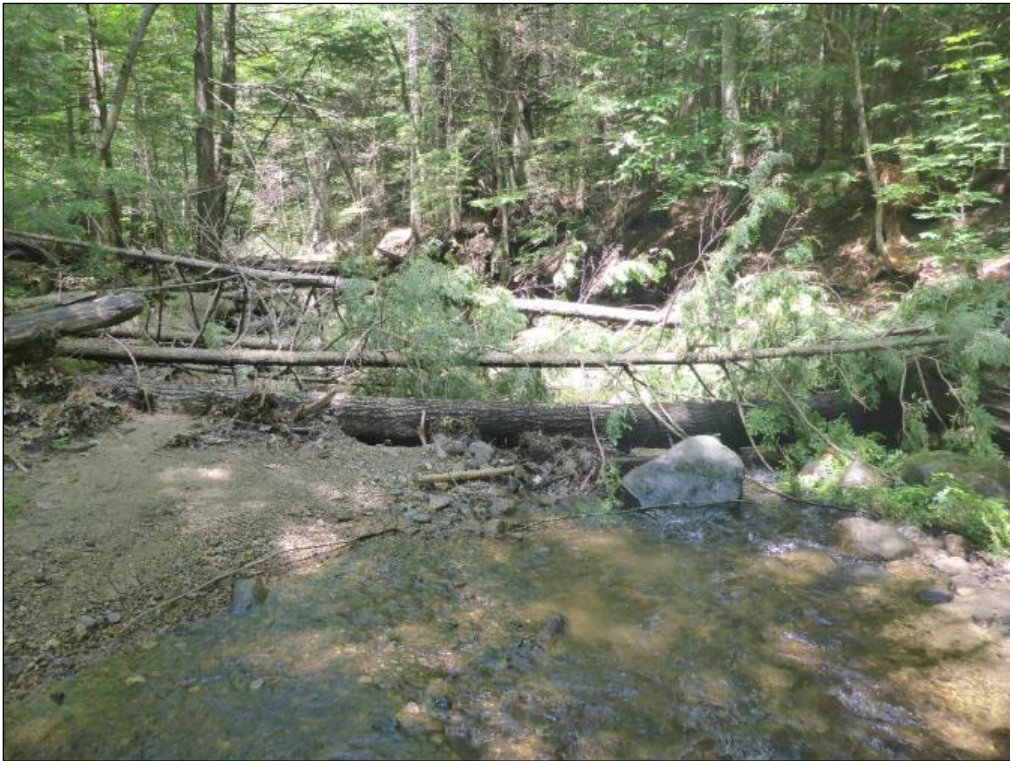
Installation Site 50: N 43.56034°, W -71.36129°. Three eastern hemlock were added to this location.