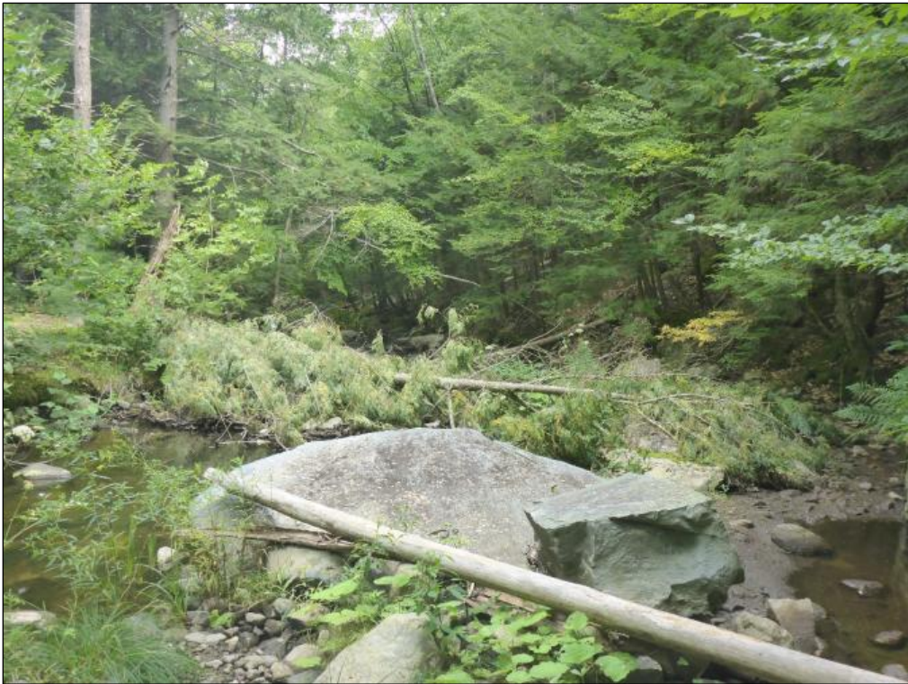
Installation Site 83: N 43.56861°, W -71.35796°. Two eastern hemlock were added to this location.