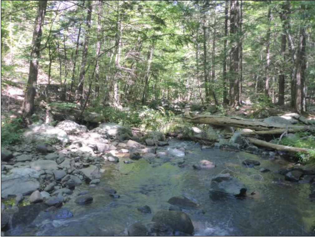
Installation Site 94: N 43.57103°, W -71.35706°. One eastern hemlock and one black birch were added to this location.

This 4,300-foot reach of Poorfarm Brook is located on the Gunstock Village Water District & Ellacoya State Park property, with an average bankfull width of 30 feet. Along this reach, a total of 34 large-wood structures were installed, using trees with an average DBH of 21.3cm. With concern regarding the possibility of wood mobilization during high-flow events within this section of Poorfarm Brook, large-wood structures were not installed within 500 feet upstream of the Lake Shore Road (Route 11) crossing. Although lacking, this reach of Poorfarm Brook featured the most naturally occurring instream large-wood. Additional large-wood was added to existing natural instream structures with the goal of increasing beneficial hydraulics, encouraging the development of pools and riffle reaches.