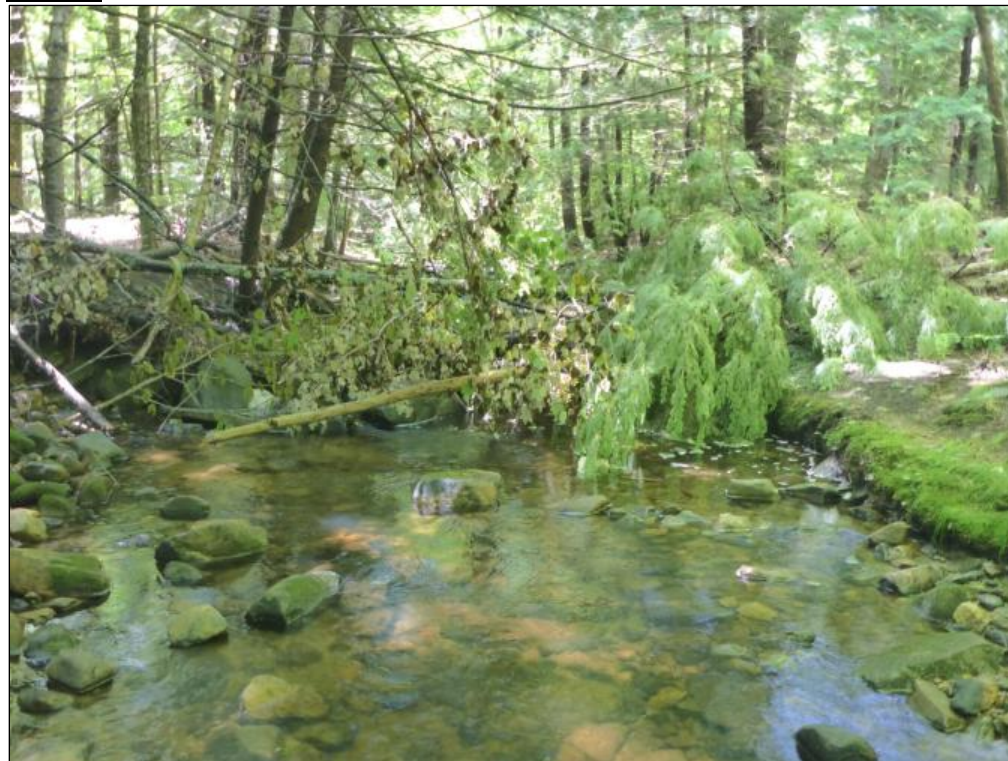
Installation Site 30: N 43.54919°, W -71.35808°. One eastern hemlock and one red maple were added to this location.