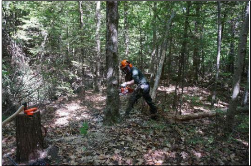
Team sawyer Joel DeStasio felling a tree into the stream channel.

have the ability to control flow energy expenditure, sediment transport, and channel morphology, creating greater habitat diversity. A lack of instream large-wood can result in increased flow energy, which moves sediment out of the system and has the potential to erode the streambed and streambanks. This can lead to channel incision, which interrupts floodplain connectivity, and poor habitat conditions.