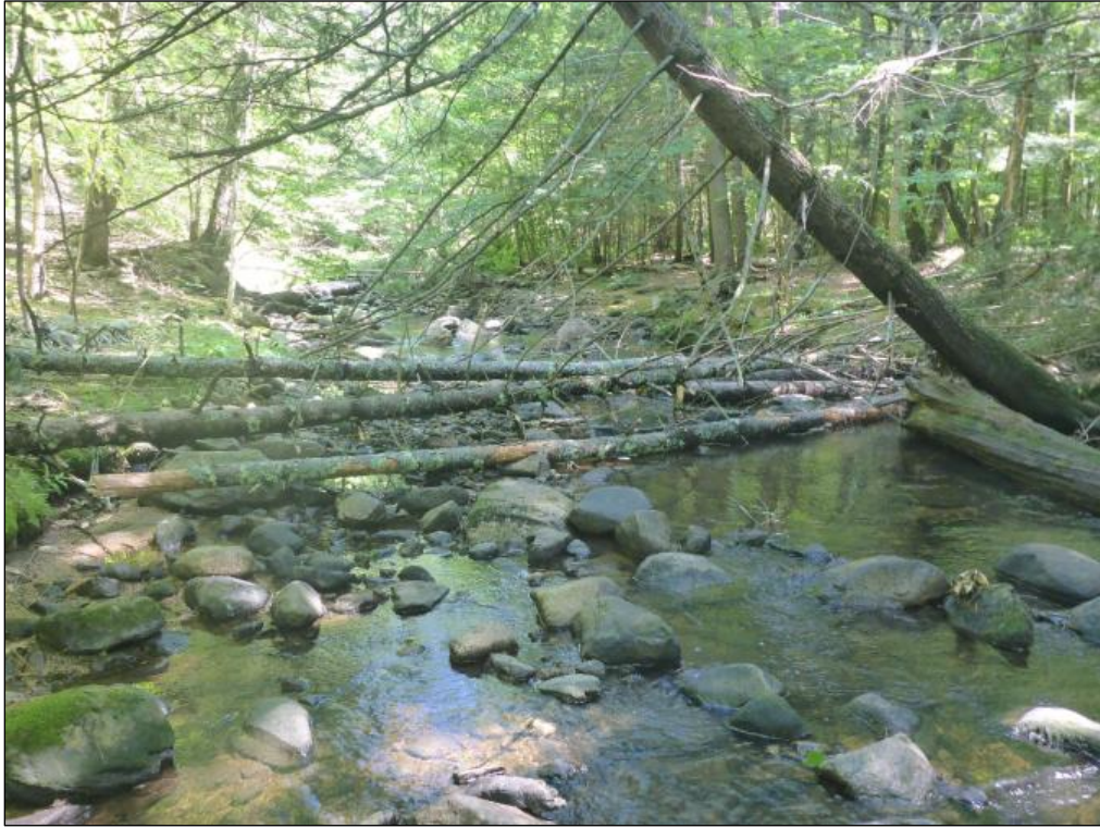
Installation Site 58: N 43.56243°, W -71.36277°. Two eastern hemlock were added to this location.