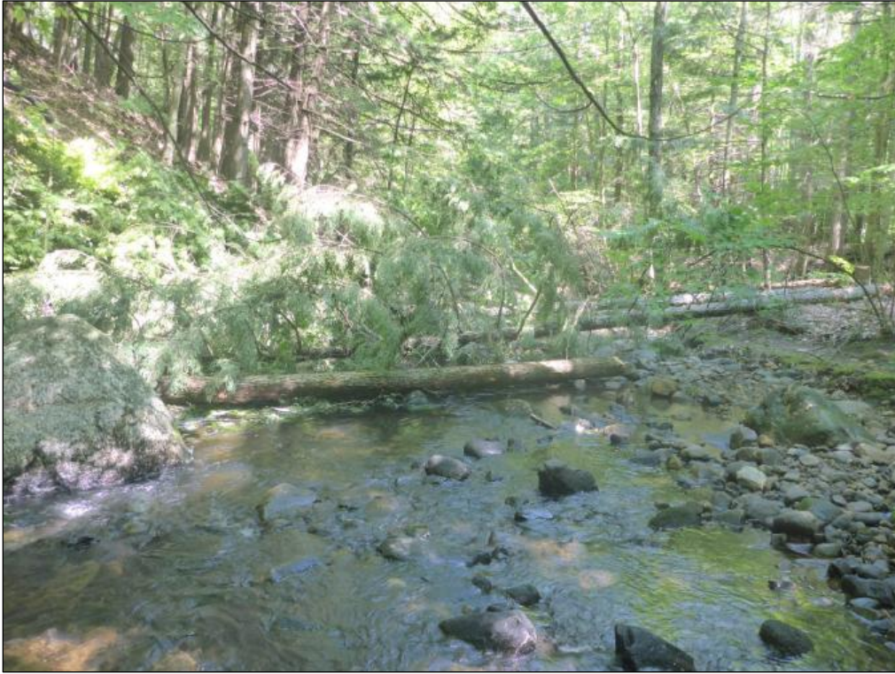
Installation Site 73: N 43.56759°, W -71.36213°. One eastern hemlock and one red maple were added to this location.