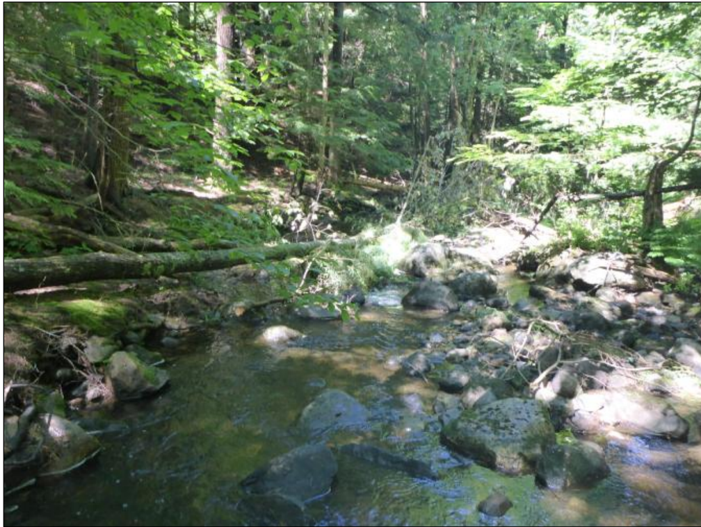
Installation Site 16: N 43.54673°, W -71.35358°. One eastern hemlock, one beech, and one red maple were added to this location.