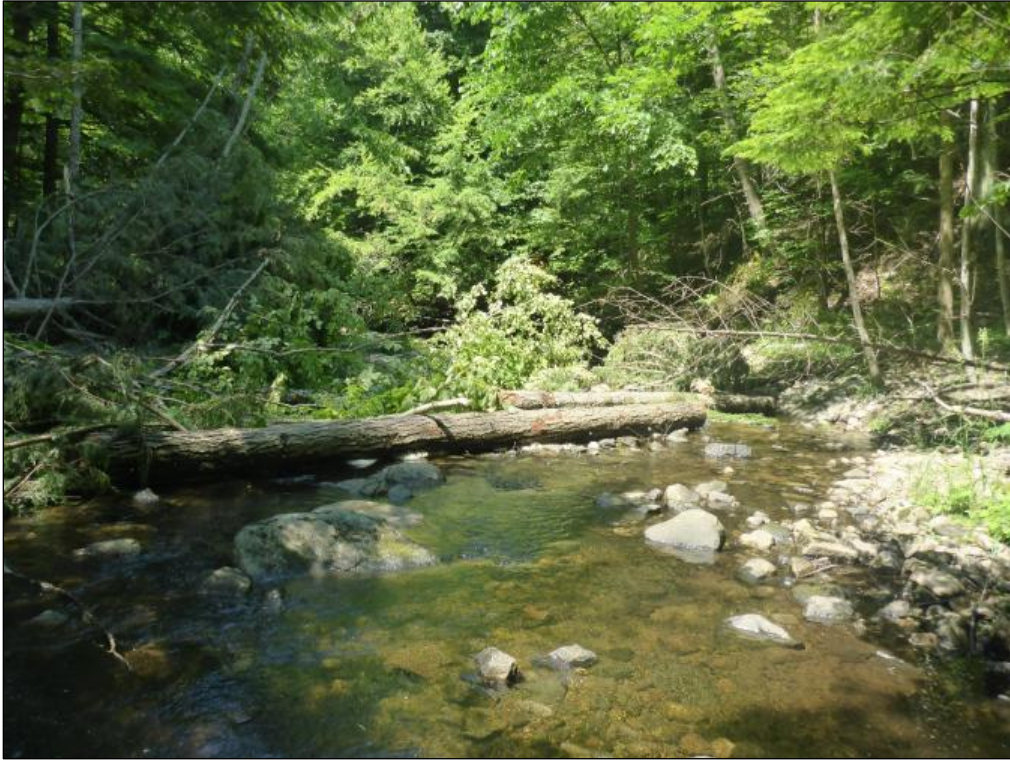
Installation Site 47: N 43.55946°, W -71.36046°. One eastern hemlock and one beech were added to this location.