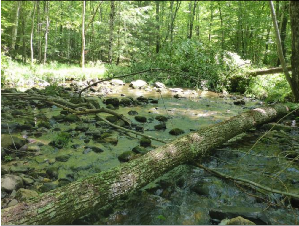
Installation Site 37: N 43.55024°, W -71.36188°. One eastern hemlock, one yellow birch, one linden, and one american elm were added to this location.