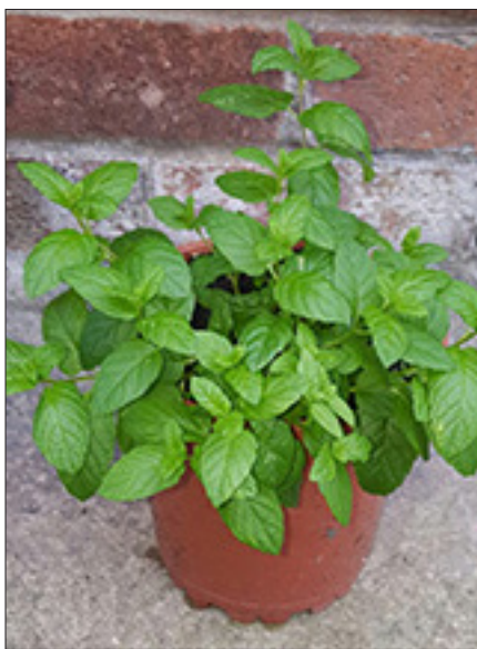
Mint grown in a pot.

A lightweight soil that holds nutrients and moisture, yet drains well, is essential for good results.