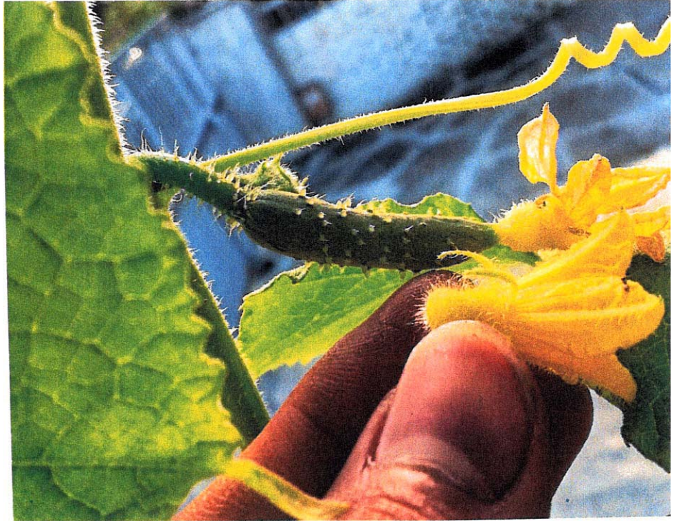
An example of a Female and a Male cucumber blossom