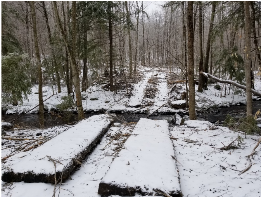
Bridge panels removed to allow for free streamflow. Left on site for return next season.