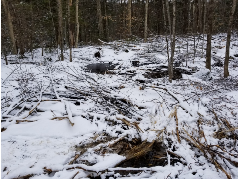
Tree tops and small trees placed in wet and heavily used areas using material onsite.