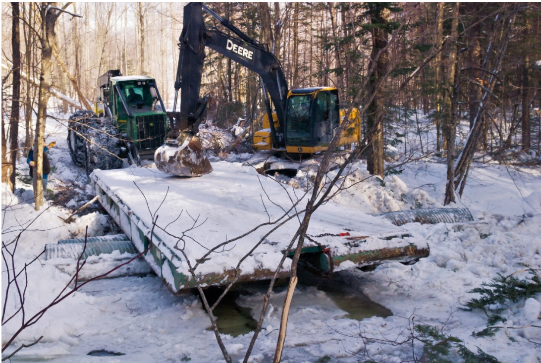
Bridge panel being placed and equipment remains out of the stream channel.