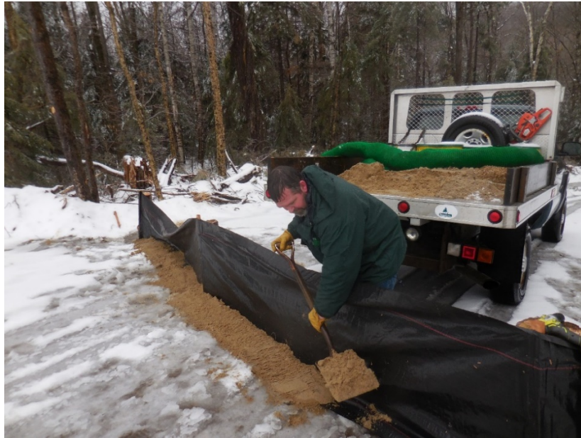
Installation of a silt fence with sand.

Temporarily secured in place with sand or onsite soil and remove after season thaw and when you can install a proper water-bar