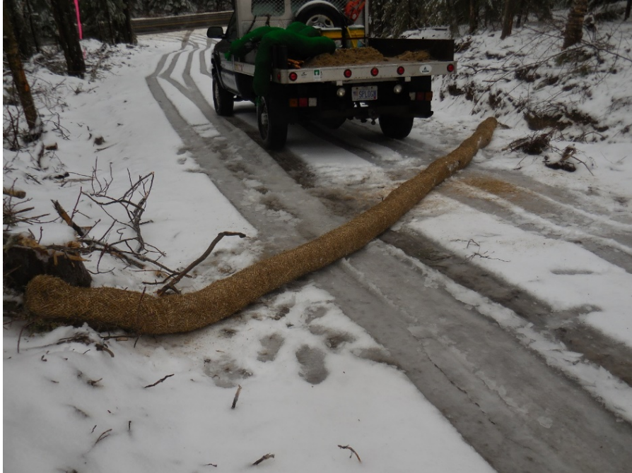
Straw wattle placed on frozen ground at a 30-degree angle.

A straw wattle is a cylinder of compressed straw fibers wrapped in tubular woven jute-netting. Install at a 30-degree angle, secure in place and remove after the season thaw and when you can install a proper water-bar.