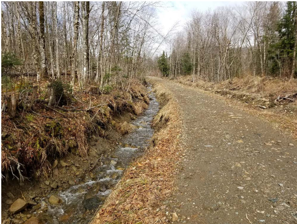
Ditches with sediment-free water flowing after the trees were removed and processed.