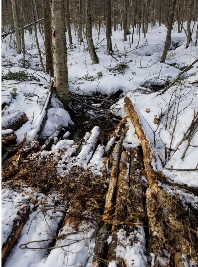
Pole fords placed in narrow streams.