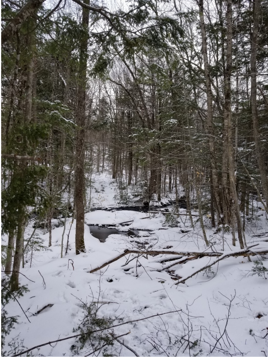
Old skid trail at stream crossing in poor condition not used in this harvest.