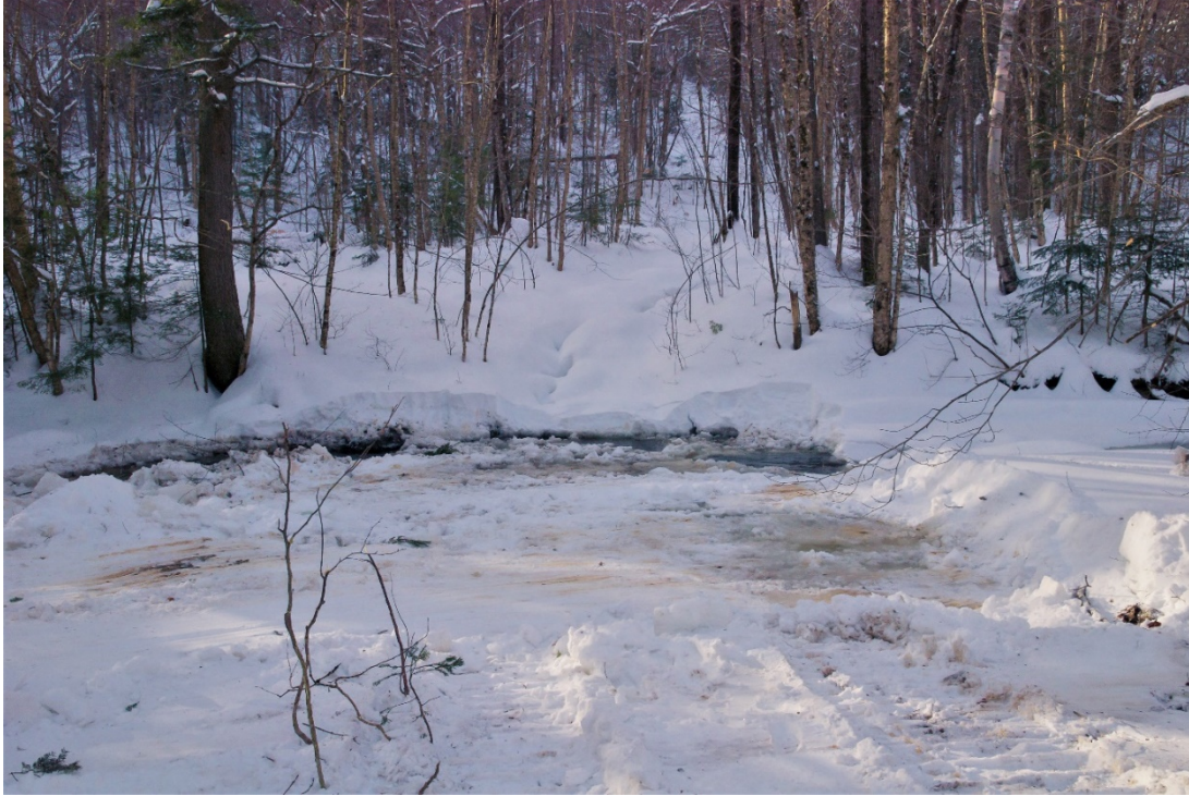
Winter stream crossing location with low, broad approaches and wet soil necessitating use during frozen conditions.