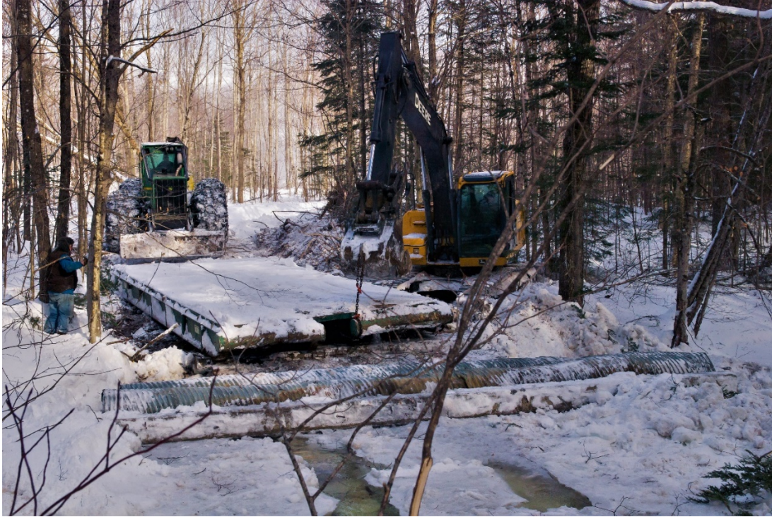
Culverts in place parallel to the stream channel and bridge panel being placed.