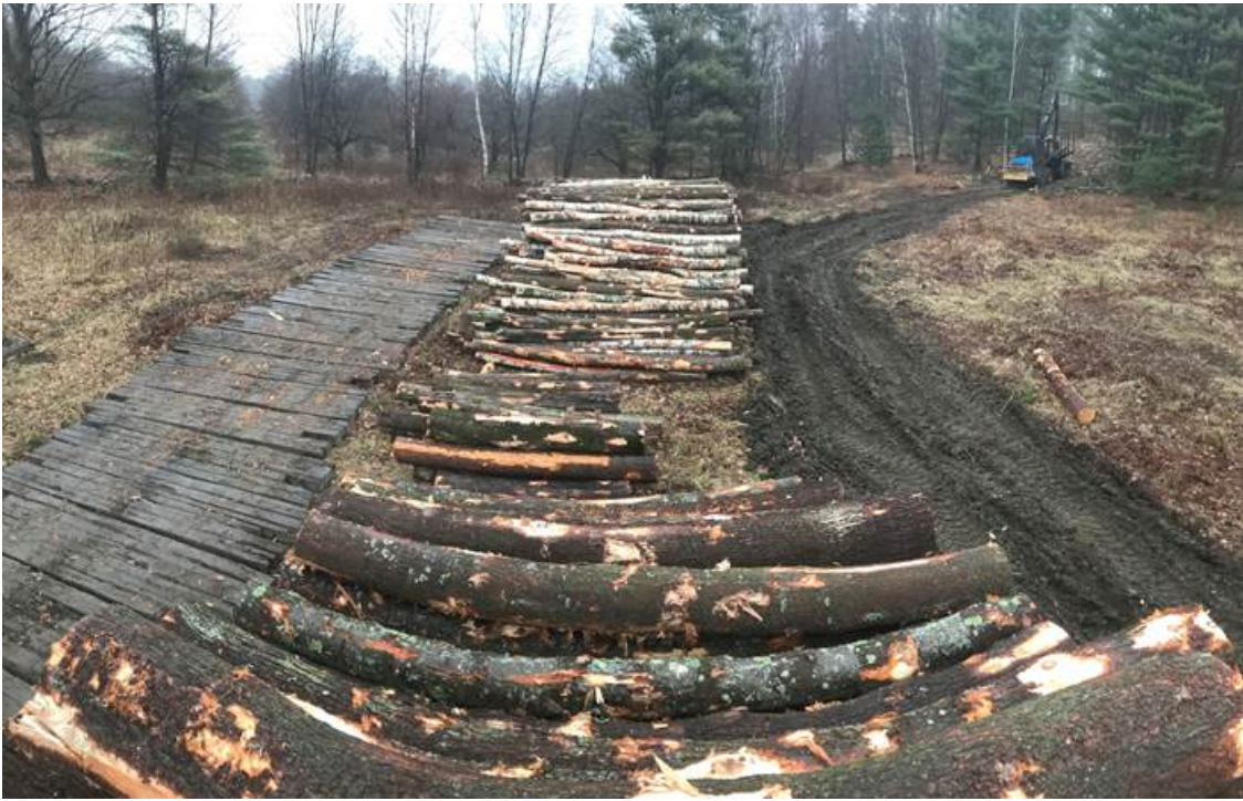
Preconstructed timber mats placed in a wet area and high traffic zone to the left of the log pile.

Preconstructed mats are reusable and used to support heavy equipment in wet and heavily used areas.