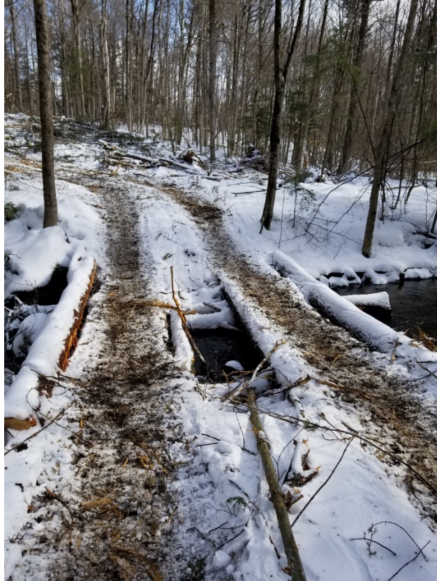
Bridge panels installed across stream. Located at narrow section with short span. Installed log headers on each bank to help extend length.