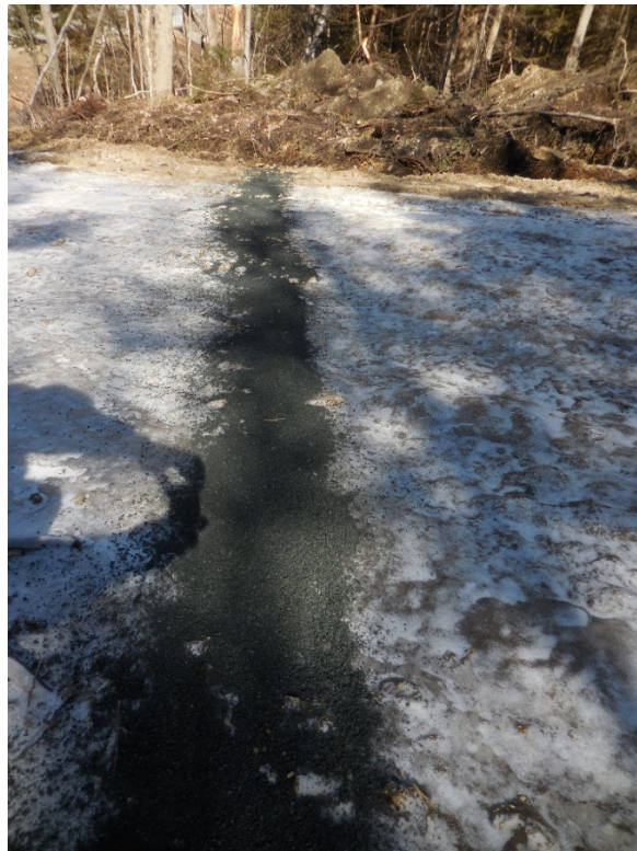
Salt placed on a woods road. Showing melt in advance of placement of water bar.

Standard road salt can be placed on a skid trail or road at a 30-degree angle to melt soil ice, so the soil can be dug and a water bar installed.