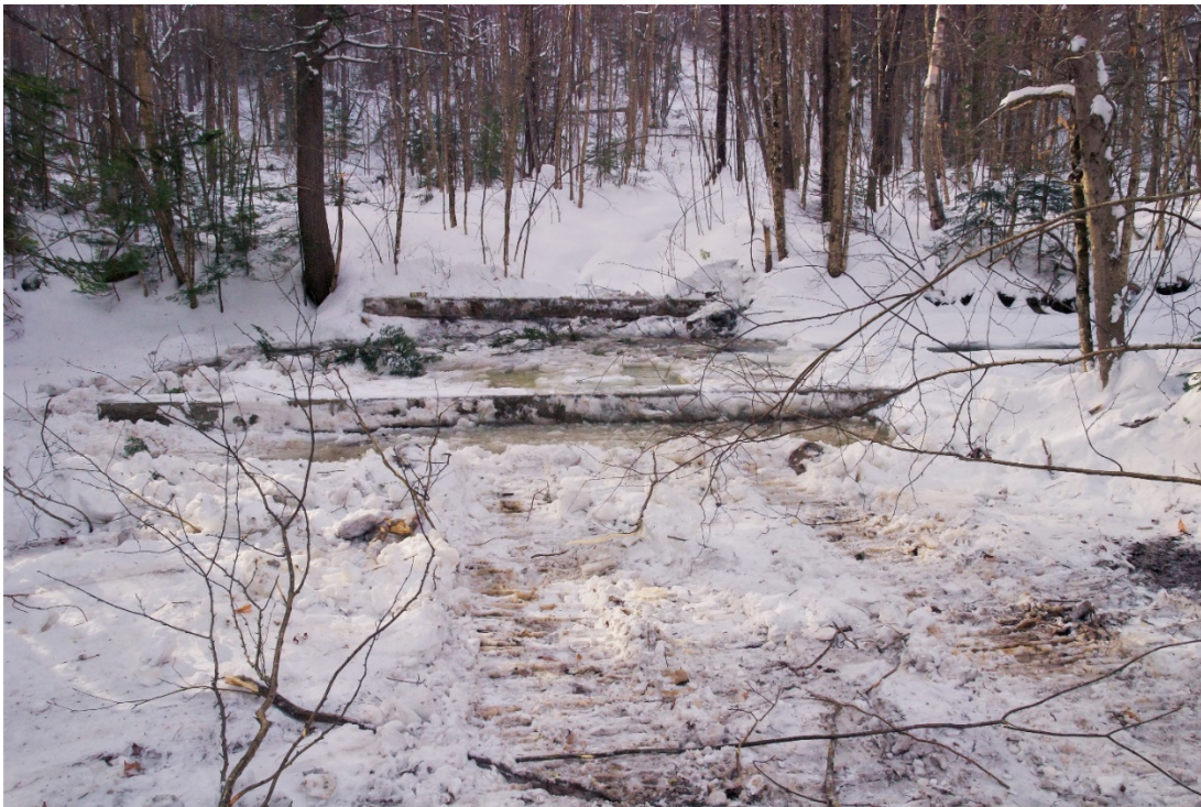
Logs placed parallel to the streambanks for bridge panels to be rolled onto.