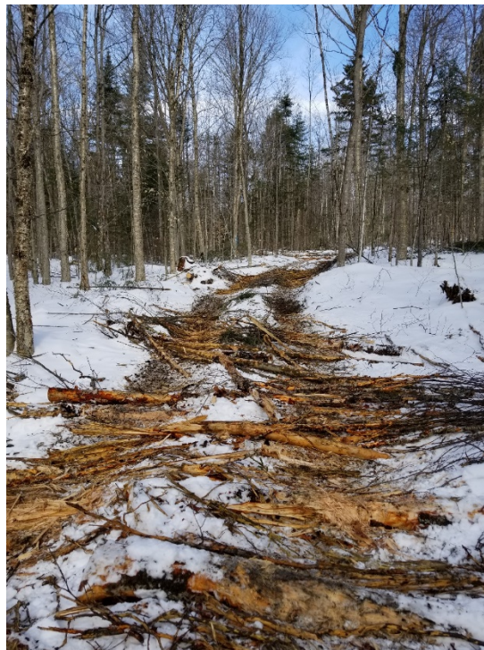
Corduroy on a wet section of a skid trail.

Small logs, poles or tree tops placed perpendicular to travel in wet areas—without a defined stream channel—can be left in place after the harvest.