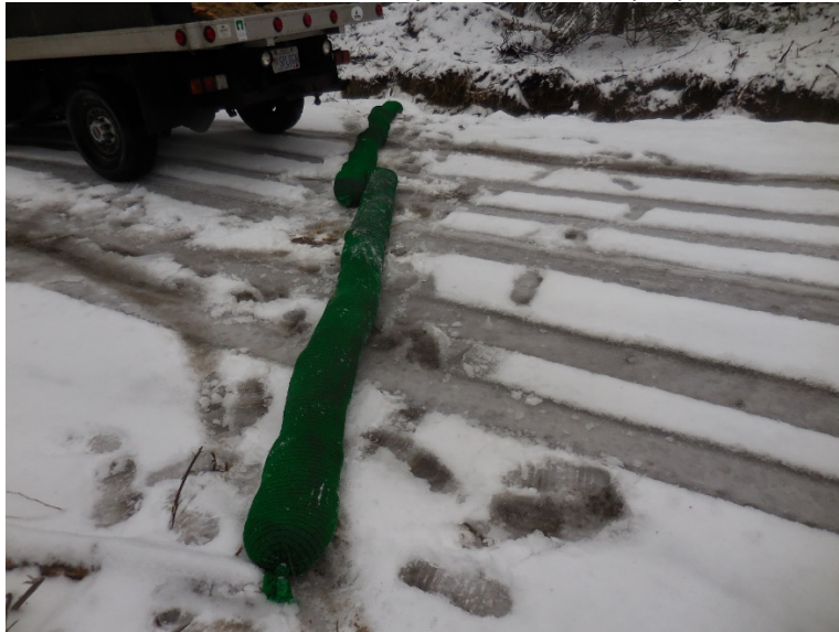
Compost sock placed on frozen ground at a 30-degree angle.

Similar to a straw wattle, a compost sock is filled with compost. Install at a 30-degree angle, secure in place and remove after the season thaw and when you can install a proper water-bar.