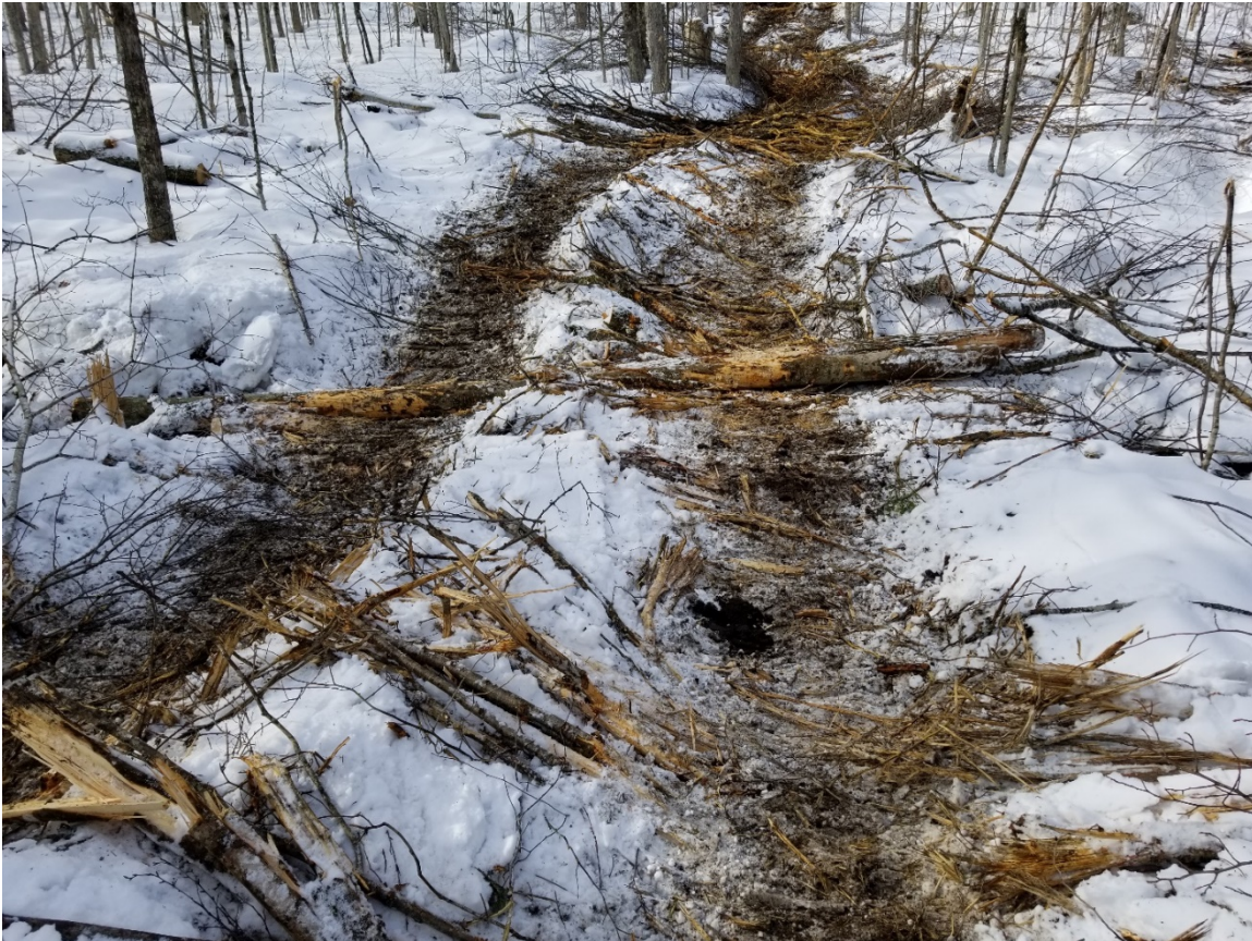
Log used to divert water in a skid trail on frozen ground.

Water bars can't be properly installed when the ground is frozen solid. This is where planning ahead can be useful. An option is to install reinforced waterbars before the ground freezes. A log-barrier water bar is perhaps the simplest and most effective water-diverter when the ground is frozen. The log is placed at 30-degrees to the direction of the road or trail. Slash and other loose material is placed against the uphill side to serve as a filter for water flowing down the road. This technique is for short-term use when a proper water bar cannot be used because the ground is frozen or ledge prevents digging.