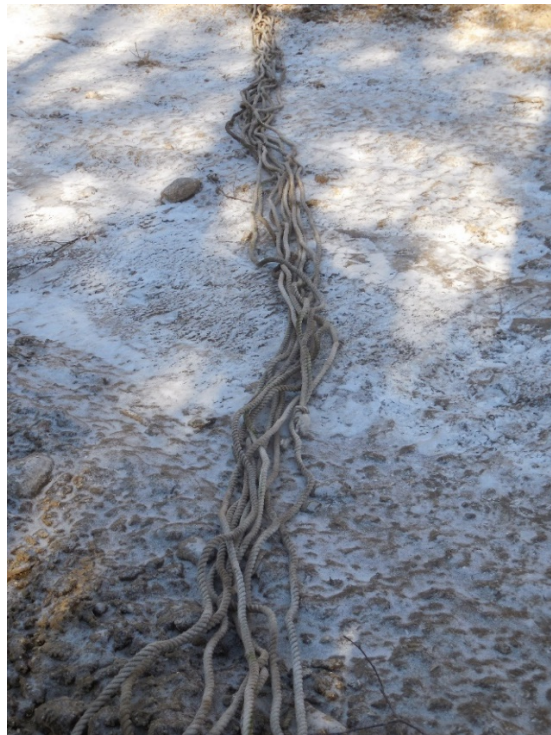
Heavy-duty rope laid on top of frozen ground acts as an impromptu water-diverter.