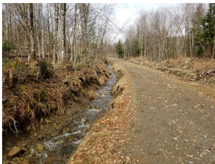
Ditches with sediment-free water flowing after the trees were removed and processed.