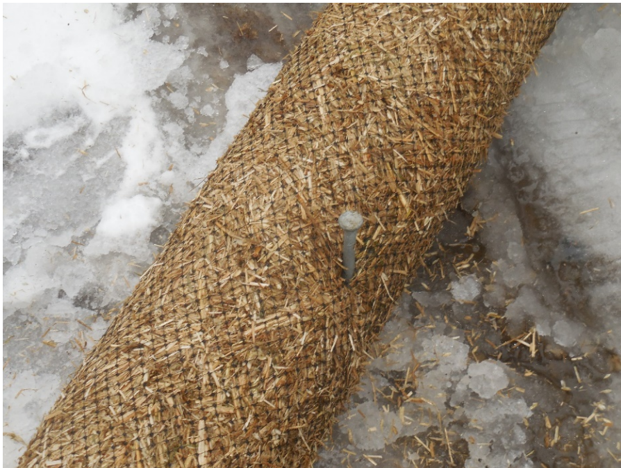
Close-up of straw wattle install on frozen ground secured in place.