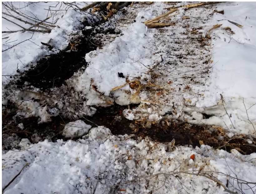
Pole ford removed at the end of winter to allow for spring runoff. Material left onsite for use upon return the following winter.