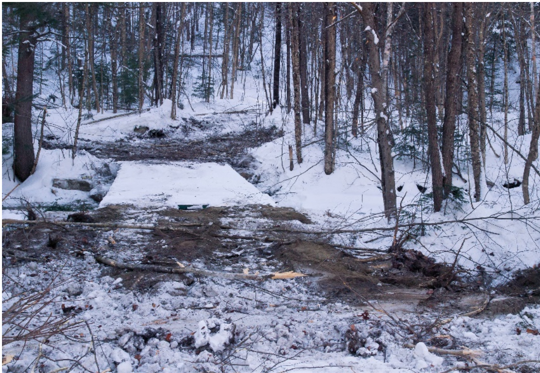
In-skid trail view.