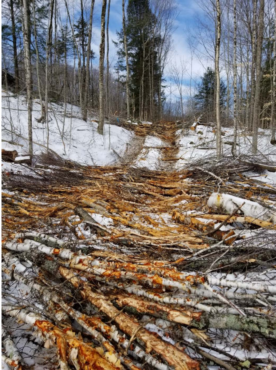
Heavy brush on skid trail; continuously reinforced brush mat in areas that needed it. Brush mat was laid down with processor placing limbs and tops of trees in front of the machine.