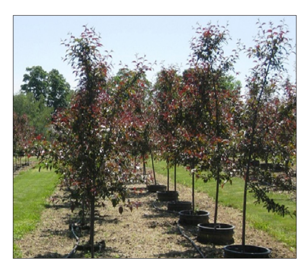
Crabapple trees growing in plastic pots (right) and fabric bags (left) in a research trial at UNH.

Water as needed for a year or more. Shrubs will become established during the first year, but trees will take more than one year to grow anadequate root system. Don't expect to see much growth above-ground the first season. After that, most trees will grow .5 to 1 inch in diameter and several inches in height each year. But, keep watering them whenever the soil is dry. A two-inch diameter tree will take two years before it can be expected to survive on its own without supplemental watering.