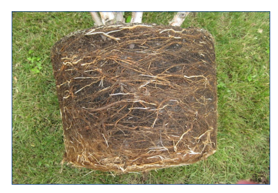
Fig. 1. Woody plants grown in plastic containers often have dense, matted roots. This plant is "potbound" or "root-bound".