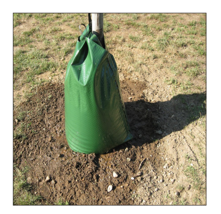
Fig 8. Watering aids such as this can be used to provide slow application of water over the root zone. Don't forget to refill them frequently.

dry out very quickly and need more frequent irrigation than B&B trees for the first several weeks--even into the fall months, which is a good time for root growth. Apply water right over the original root ball, as well as to the backfilled area, because water from the surrounding soil will not move laterally into the porous potting medium where most of the roots are. Skip watering only if you get more than an inch of rain or can tell that the soil is moist. Don't depend on your lawn sprinklers to provide the right amount of water for your new shrubs or trees.