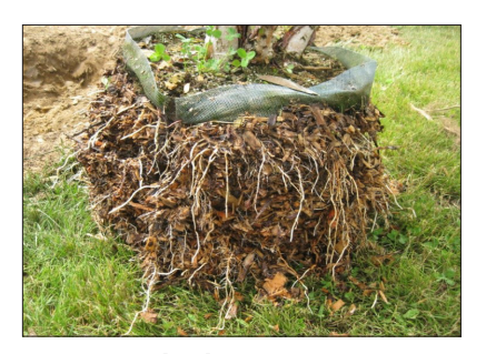
Fig. 3. Woody plants grown in porous fabric containers have most of their roots contained within the bag, and the small roots that grow through can be easily shaved off before removing the bag.