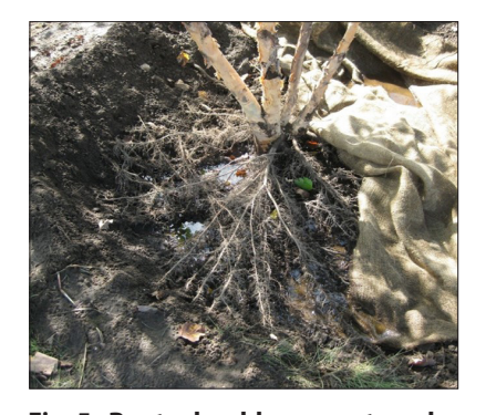
Fig. 5. Roots should grow outwards from the trunk in a radial pattern, like spokes on a wheel (top). (These roots have been exposed for illustration; you should not expose the roots on your plants.)