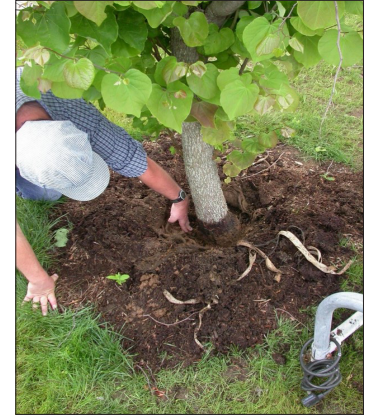
Fig. 6. This redbud tree was dying from the top down (left photo). It was planted too deeply and the straps and burlap were still wrapped around the trunk (right photo).