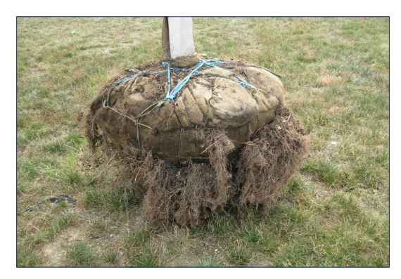
Fig. 2. Field grown trees are harvested and then wrapped in burlap and baskets for sale and handling. Trees like this leave over 80% of their roots in the nursery. The roots outside the burlap regenerated in a mulch layer while being held in a sales yard.