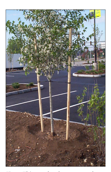
Fig 7. This tree has been properly planted and staked. Note the donut-shaped soil dam. Now it needs water and mulch.

Preparing the hole properly is more important than adding any amendments.