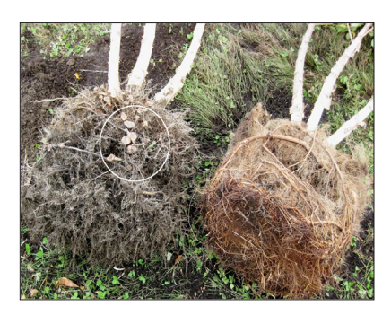
Fig. 4. These root systems have had the soil washed off in order to compare the roots structure of birch trees produced in a plastic pot (right) with those from a fabric container (left). Large circling roots and the bottom root mat should be removed from the plant on the right before transplanting. The plant on the left has better root structure and the swollen root nodules (circled) provide energy stores for new root growth.

A third type of planting stock is sometimes available: trees grown in porous fabric containers, sometimes called grow-bags (Fig. 3). Roots in these fabric containers are generally dense but fibrous and the larger roots should form swollen nodules at the container edge, rather than circling like in a plastic container (Fig. 4). The nodules store carbohydrates that are used for rapid root growth once transplanted. Trees grown in fabric containers are lighter weight and easier to handle than B&B plants, so they require staking and frequent watering after transplanting. Research at UNH shows that these root systems have structural advantages for trees and may enhance growth and longevity.