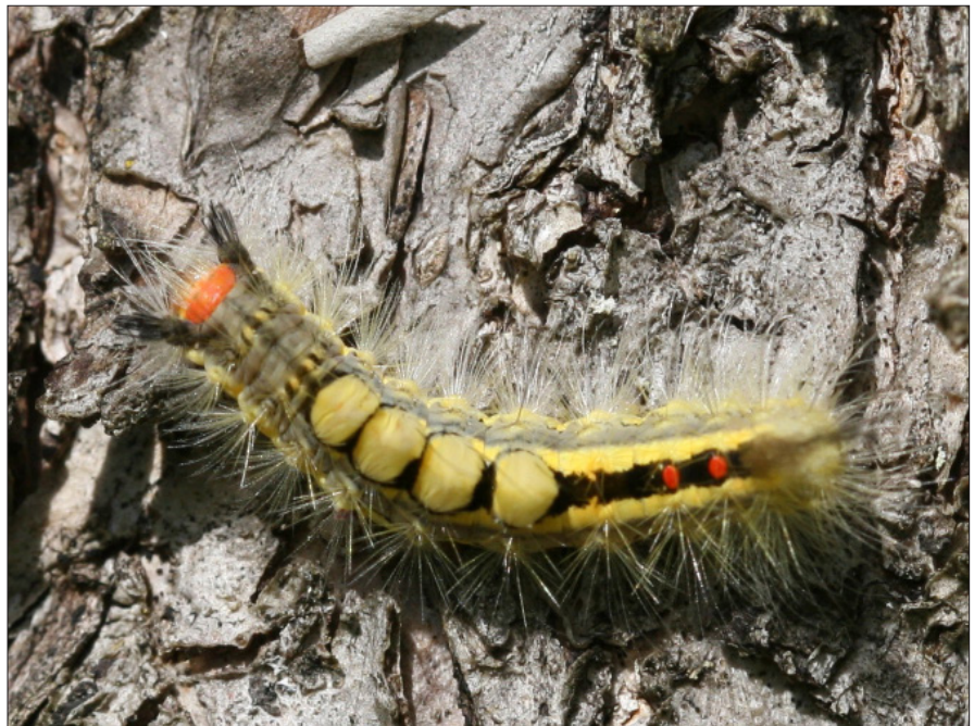
White-marked tussock moth larvae die if they eat foliage sprayed with caterpillar strains of B.t. insecticides.

Insect Growth Regulators (IGRs) Methoprene and pyriproxifen are examples of IGRs. Insects go through a process of growth and development that necessitates molting, a process of shedding the “skin” and growing a new one. Some molts also result in a change in form — a caterpillar changes to a chrysalis, for example. Certain hormones control the entire process of molting and changing form. IGRs mimic those hormones or their actions. This results in changes that cause the insects to die, such as trying to change into an adult or pupa when the insect is not physiologically ready. IGRs only affect immature insects. If you expose adult insects to IGRs, they show no effect. Since humans don't have these insect hormones, IGRs appear to have a wide margin of safety for people.