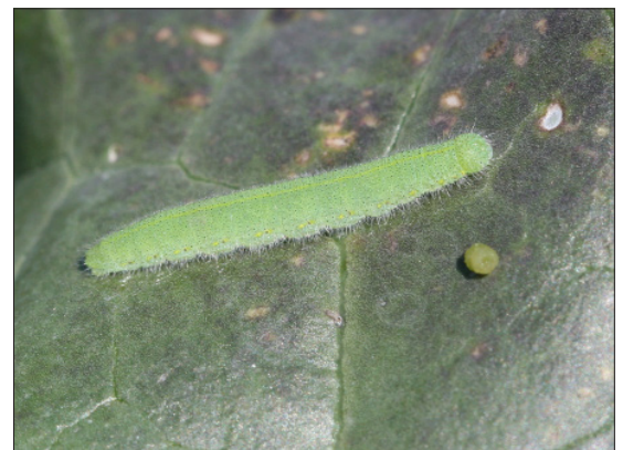
Imported cabbageworm, a possible target for caterpillar strains of B.t.