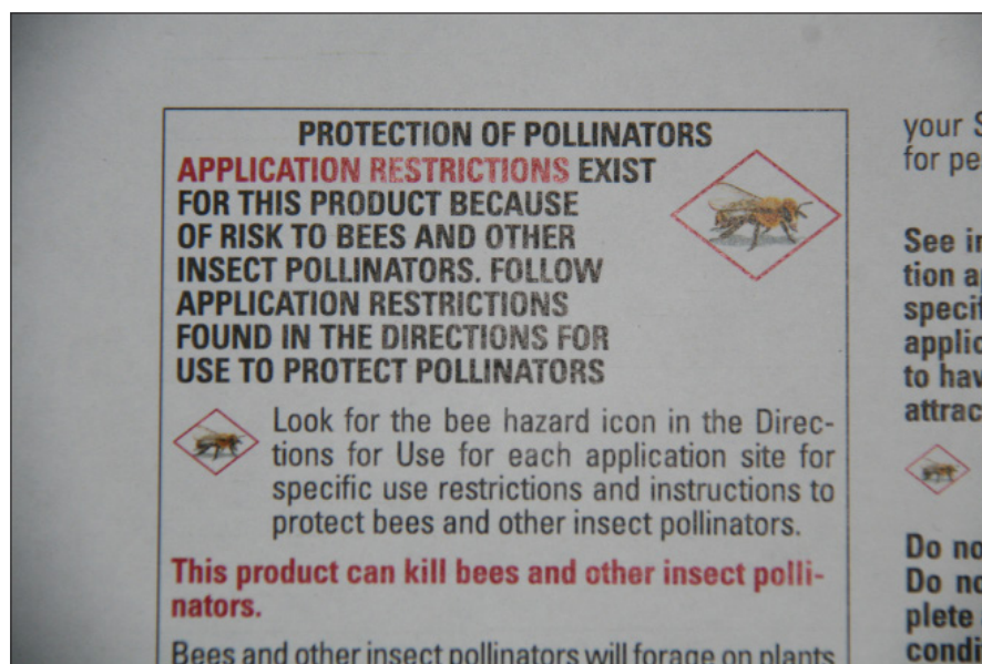
Recent pesticide labels show a honeybee icon if the material is highly toxic to bees.