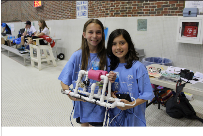
4-Hers with their SeaPerch.

Youth learn to build an ROV from basic materials starting with a frame made from PVC pipe. The frame provides a chassis on which youth can attach motors and accessories such as a camera or extension arm. Motors are made water-tight, then attached to the frame giving the ROV thrust and steering capability. Youth solder and wire the motors to a control box made of simple switches at the other end of a 40-foot cable that allows them to operate the motors.